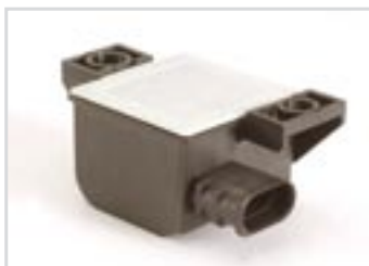
Automotive tyre pressure sensor