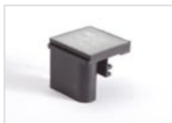
Automotive clutch sensor